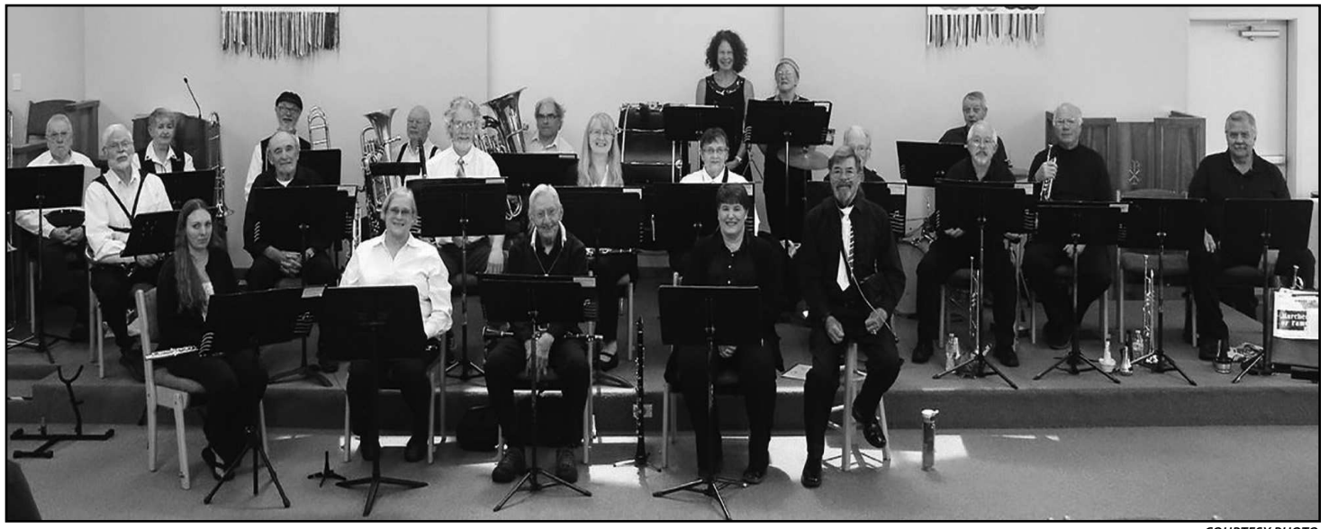
Members of the Pacific Coast Wind Ensemble

The Florence Events Center (FEC) invites artists to submit artwork, including 3-D and photography, for an October exhibit that is both seasonal and unusual. Fall lends itself to great artistic opportunities with autumn colors, the fall harvest and wildlife preparing for winter. Applications are available at www.eventcenter.org under the Gallery section, or pick up an application at the FEC office, 715 Quince St. The fee is $15 per rod for up to three pieces (depending on size of art pieces), or up to three pieces of 3-D art for the glass case. Applications for submissions are due Sept. 21. For more information, call Julie Peake at 503-516-5594.