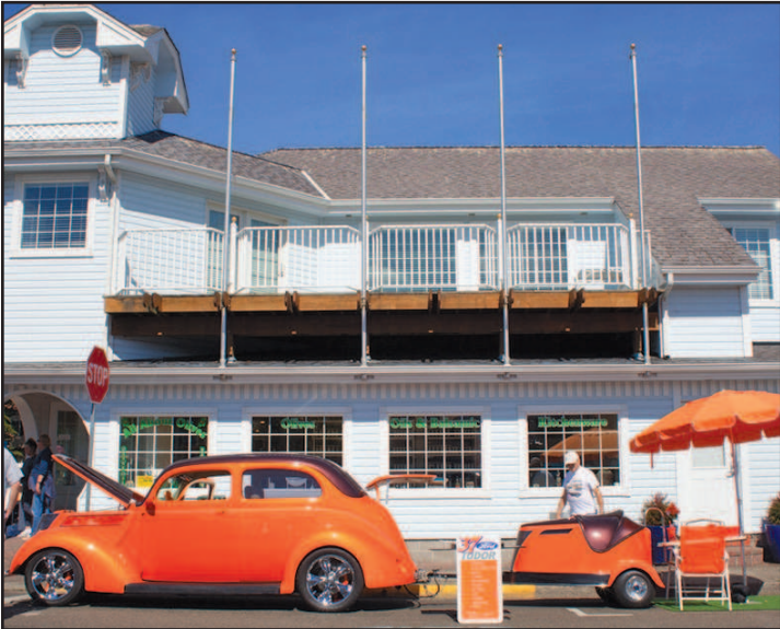
The Rods 'n Rhodies People's Choice Award went to Craig Spotts' 1937 Ford Tudor, with matching trailer.