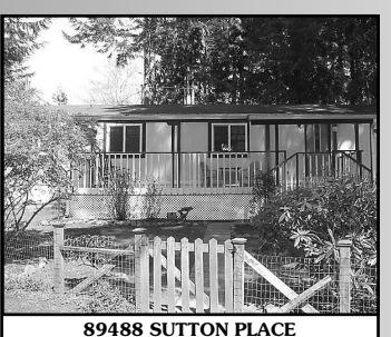
Cozy home completely remodeled -weekend spot, vacation home or live there full time. Large corner lot, garden area, shop, garden shed, storage shed and extra park-ing. Large deck offers great area to sit and enjoy the natural surroundings. $159,500 #11615 MLS#18665750