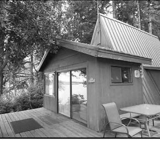
CHARMING CABIN ON THE LAKE! his property is closest to the ramp. Nice ce dar interior. There is a wrap around porch to enjoy the lake view. 72-hour notice required for showings, contact listing agent for appoint ment. More pictures to come. $198,000 #11580 MLS#18614351