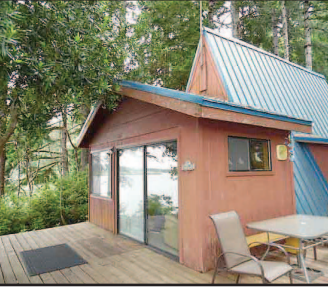
CHARMING CABIN ON THE LAKE! This property is closest to the ramp. Nice cedar interior. There is a wrap around porch to enjoy the lake view. 72-hour notice required for showings, contact listing agent for appointment. More pictures to come. $198,000 #11580 MLS#18614351

89488 SUITON PLACE Cozy home completely remodeled - great weekend spot, vacation home or live there full time. Large corner lot, garden area, shop, garden shed, storage shed and extra parking. Large deck offers great area to sit and enjoy the natural surroundings. $159,500 #11615 MLS#18665750