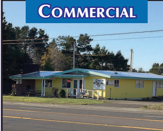
3611 HWY 101 Excellent commercial location @ U.S. Hwy 101 and 36th Street. 1/4 block w/ 2742 SF building and paved parking lot. Currently a restaurant, this property will provide a wide variety of uses w/ Highway District Zoning. High traffic, busy location in the heart of Florence. $245,000 #11567 MLS#17012099

118 SHORELINE DAVE CUSTOM Graciously appointed and spacious this extremely well maintained Shelter Cove home is over 3000 sq ft, 3+ bedrooms, 3 baths, an amazing home office, chef's kitchen, granite, newer SS appliances, hardwood and tile floors, propane fireplace, over garage suite with bathroom, tile roof and just painted exterior. An exceptional value must see to appreciate. No disappointments. $464,900 #11711 MI Se18514159