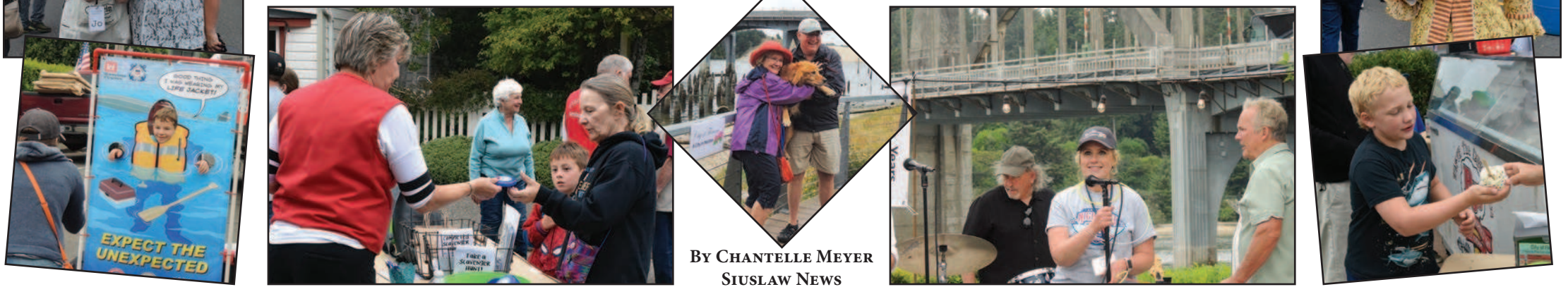
BY CHANTELE MEYER SIUSLAW NEWS

City of Florence's 125th anniversary closes Bay Street for Block Party