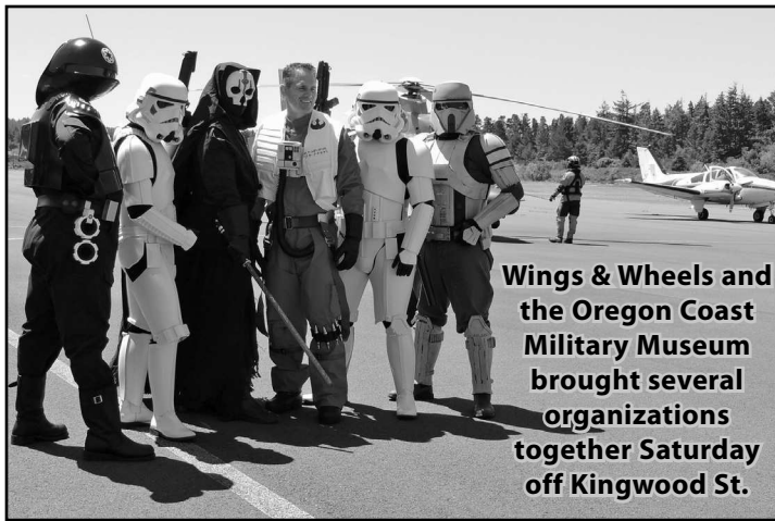
Wings & Wheels and the Oregon Coast Military Museum brought several organizations together Saturday off Kingwood St.

Wings and Wheels were the 110 classic automobiles that entered the car show portion of the event, which was coordinated by the Oregon Coast Hot Rod Club. Central Oregon Coast British Car Club also showcased vehicles.