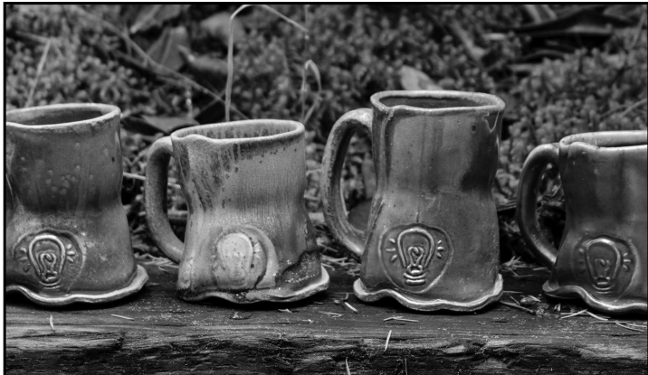
Artwork by area artists is on display in Florence now.

Florence Regional Arts Alliance (FRAA) is getting a lead on the 2nd Saturday Gallery Tour by having a reception instead on Wednesday, July 11, at the Florence Events Center (FEC), 715 Quince St., from 5 to 7 p.m. This is the artist reception for FRAA and the Friends of the FEC’s “Spirit of Summer,” open now