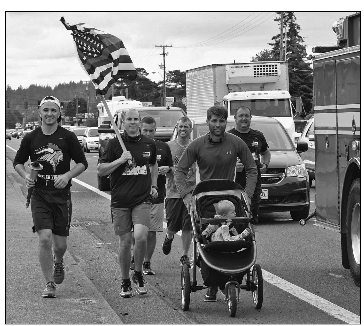
U.S. Coast Guard Station Siuslaw River members participating in Law Enforcement Torch Run through Florence on Highway 101.