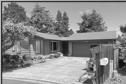
2275 10TH STREET

Close to Bay Street and Downtown Florence. This ranch style home is 1409 sq. ft. 3 bed, 2 bath, with a 2 car garage. This home has a covered deck, fenced backyard, newer paint in and out, storage cabinets in garage, vaulted ceilings, laminate floors in living room, and RV parking. $255,000 #11676 MLS#18560713