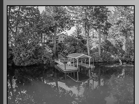
WOAHINK LAKEFRONT HOME

WEST OLD TOWN BEAUTY - End of street privacy, seclusion, and solitude. Quaint, charming & ready for you! A forest awaits you just out your living room. New December 2016: vinyl plank flooring, bedroom carpeting; new as of spring 2017: vinyl windows & ductless heat pump with A/C. Tiled kitchen. Wood burning brick fireplace and single garage. Raised garden beds, garden shed & new fencing in front yard. View 4th of July fireworks from living room. Priced to sell & won't last long. $207,500 #11623