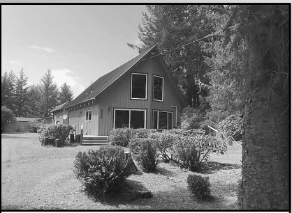
CEDAR CHALET SOUTH LAKES AREA RARE!

Designed for comfortable yet elegant lakefront living. Dock your boat (with lift & cover) & ski or wakeboard right from your property! Home features numerous upgrades including stainless steel & granite, gas fireplace with stacked stones. & huge 4 car garage. Gated & secure. Ready for summer fun on the lake! $649,950 #11622 MLS#18653835