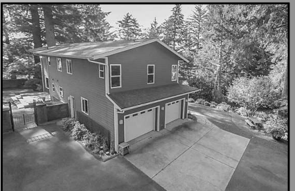
89155 SUTTON LAKE ROAD You'll love views of Sutton Lake from this cus-

Fresh & new remodel inside & out. Woodsy yet luxurious log home living near the beach. Custom tiled baths, granite & stainless kitchen. Solid wood doors. Cozy woodstove and wood beamed ceilings. Covered rear porch. Large double garage w/ workbench, wood shed. Tons of parking for those family retreats to the coast! $329,900 #11644 MLS#18678004