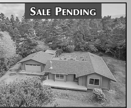
FRESH & NEW REMODEL INSIDE & OUT

Drive right out on the golf course in your golf cart. Double garage has golf cart door. Beautiful 4,000 square foot home featuring 2 master bedroom suites, guest bedroom & 3.5 baths. Gourmet kitchen features top-of-the-line appliances & walk-in pantry. Sun porch, den with fireplace, home theatre. Beautifully landscaped, all on .67 acre! $952,000 #11641 MLS#18344615