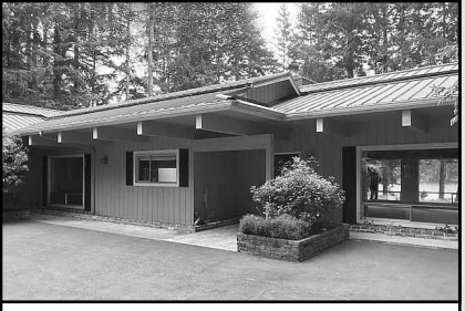
LAKE LEVEL - SOUTH FACING WOAHINK LAKEFRONT

home is offered at a price to sell. Buy now and enjoy your walks to the beach all summer long. It's about the windows: stained, bay, window seat that make this home so unique. The fireplace is stacked rock with a raised hearth in a great room with a covered deck positioned strategically off the dining room. Wide hallways lead to a Master Suite and 2 more bedrooms at the other end. $324,900 #11669 MLS#18310527