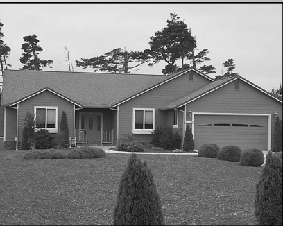
87936 LAKE POINT DR.

If you want to be on the water & enjoy the waterfront life, this is the best! Lakefront home perfectly located on quiet arm of "Summerbell" on beautiful Woahink Lake. Enjoy this incredible, one of a kind location with near perfect exposure & wind protection. This 3 BR. 3.5 BA. 3 fireplace home is waiting for your remodel dreams. Lake views from many rooms. Grandfathered boat house & dock w/ water rights. $649,000 #11666 MLS#18008031