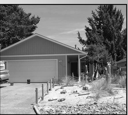
466 IVY STREET

HONEY, STOP THE CAR! Awesome 3 bed 2 bath home all on one level. Great livable open floor plan. Living room with vaulted ceilings, bay window, and ceiling fan. Kitchen has all newer Kitchen Aid stainless appliances, built-in desk, and pantry. Dining area with access to rear covered patio. Master suite with double vanities, wood floors, and large walk-in closet. Fully landscaped with sprinkler system. $289,000 #11678 MLS#18508781