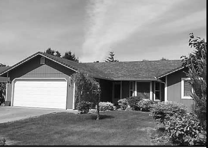
51 PARK VILLAGE DRIVE

riverfront cabin located on Duncan Island vith dock and boat house. Furnishings included. Includes a detached two car garage, a carport, plus outbuildings. Inside there is a wood fireplace and enclosed sunroom. With 0.69 acres there's plenty of room for a beautiful garden. This home could be whatever your heart desires, a gorgeous permanent home, or even a weekend getaway $230,000 #11679 MLS#18449934