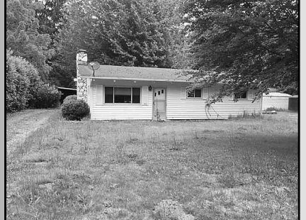
RESTING ON THE SIUSLAW RIVER

Oceanfront condo on the top floor, beautiful Heceta Beach 2 bed 2 bath unit with a lockoff suite. Indoor pool, restaurant, and more. $158,900 #11683 MLS#18201851