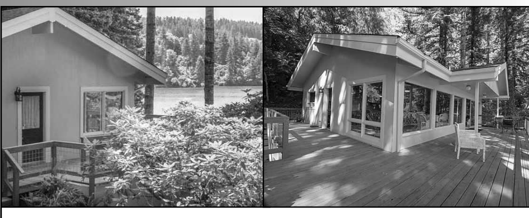
EXPERTLY CRAFTED LAKEFRONT CABIN

Breathtaking views of Mercer Lake from most of this 1584 sq ft cabin. It boasts 2 bedrooms, 1 bath, full surround deck, boat dock. Vaulted open beamed ceilings with hemlock interior walls from the 60s are praise worthy. Vintage kitchen will delight the most discerning cooks. Memories are to be made in this amazing cabin which includes most of the furnishings. $475,000 #11685