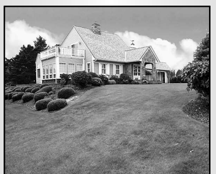
OCEAN DUNES GOLF COURSE HOME

Tremendous value in this dramatic & substantially constructed home with wood ceilings & huge beams, solid cedar sided chalet style with pegged oak floors, quality metal roof, upper loft with open floor plan, detached 2-car garage/ shop, garden area, beautiful south lake level .67 acre parcel with room to park boat & RV. You'd better hurry because this is priced to sell now! $279,500 #11631 MLS#18627293