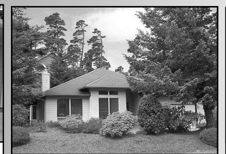
CHARMING HOME IN BEACH AREA For the young at heart this lovely 1746 sq. ft

Move-in ready, "Siletz Model" in the new gated community of Sandpines East, bordering Florence Golf Links. Morning sun floods the eat-in kitchen w/quartz counter tops in this beautiful & gently lived in home. BBQ on the wind protected covered patio in a fenced backyard. Custom roman shades through out, lovely room divider w/art niches. Roll-in shower. Enjoy sunsets & upgraded landscaping complete w/birch trees from covered front porch. $304,500 #11670