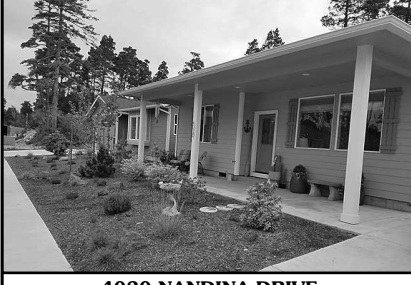
4020 NANDINA DRIVE

OUTSTANDING RIVER VIEW HOME PRICED TO SELL! This is an exceptional opportunity for the right buyer. Located at the end of 10th this 1472 sqft. 3bed, 2bath, 2 fireplace home has a commanding view of the Siuslaw River, 2 cars detached garage, small greenhouse/ artist studio and some truly amazing landscaping. Home prices "as is" to allow new owners to address some foundation and flooring concerns. Hurry on this one. This won't last! $239,000 #11675 MLS#18340762