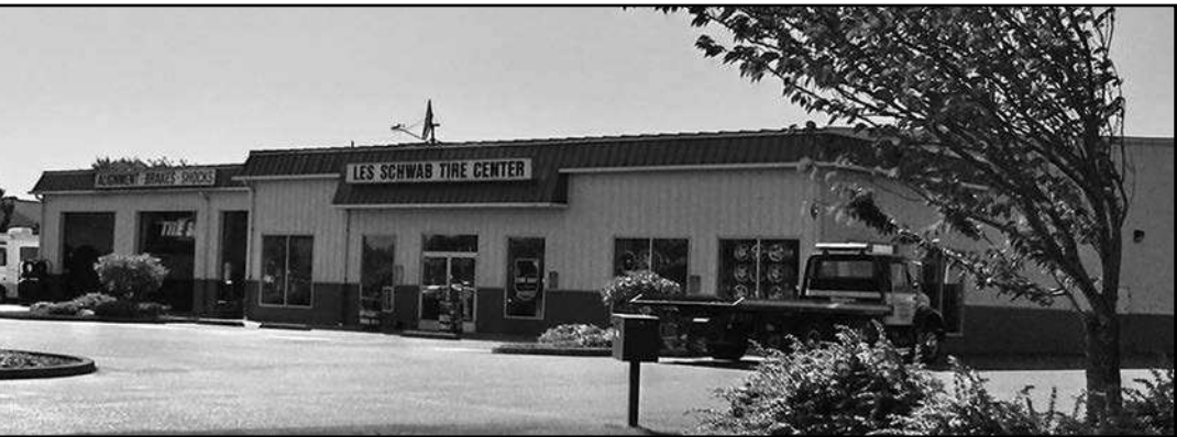
Les Schwab Tire Center, 4325 Highway 101 in Florence

Employees at each local Les Schwab Tire Center believe in giving back to the community where they live and work. In Florence, we sponsor activities large and small, supporting youth programs, helping families in need and raising funds for good causes — because these are values we believe in.