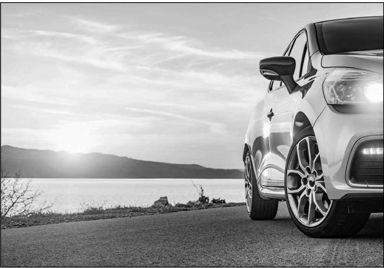
Keep summer road trips safe for all involved by doing simple steps before and after you hit the road.

• Plan your route. Map out the route before heading out. Be aware of po-