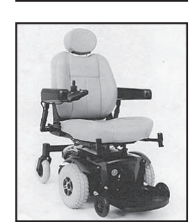
JAZZY POWER CHAIR $350

Queen bed, couch, deer slide out, power jack & awning, nice indoor & outdoor kitchen, TV & music. Perfect tail-gater. $34,000 obo 541-902-8593