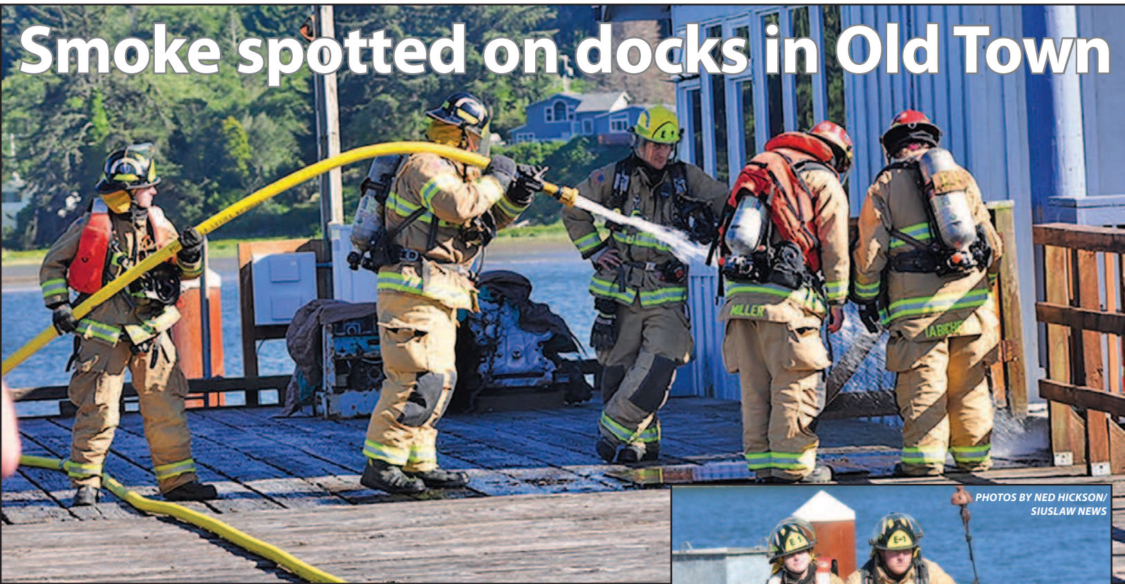
Siuslaw Valley Fire and Rescue firefighters soak the dock near Mo’s Restaurant, 1436 Bay St., after restaurant employees reported smoke coming from under the dock Monday. See FIRE page 11A.