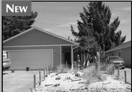
466 IVY STREET

OUTSTANDING RIVER VIEW HOME PRICED TO SELL! This is an exceptional opportunity for the right ouyer. Located at the end of 10th this 1472 sqft. 3bed 2bath, 2 fireplace home has a commanding view of the Siuslaw River, 2 cars detached garage, small greenhouse/ artist studio and some truly amazing landscaping. Home prices "as is" to allow new owners to address some foun dation and flooring concerns. Hurry on this one. This won't last! $239,000 #11675 MLS#18340762