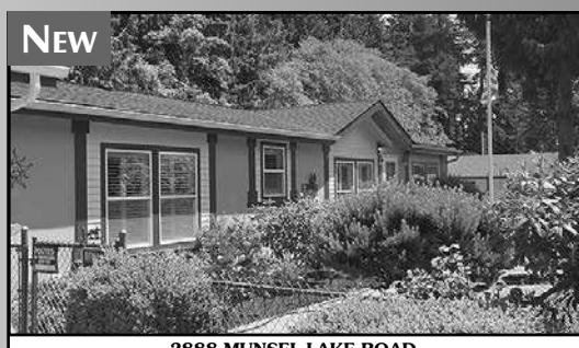
2888 MUNSEL LAKE ROAD wooded 1/2 acre lot. Low maintenance landscaping and rhododendrons. Fenced front yard and fenced in area in backyard. Pad and electrical installed for hot tub. Oversized garage and Plantation shutters throughout. New roof in 2017 with 30 year warranty. Well maintained and cared for home. RV electrical hookups on north side of garage. $269,000 #11674 MLS#18614513