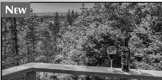
INCREDIBLY RARE 51 ACRE PARCEL Oregon Coast Property! INCREDIBLY RARE 51 ACRE parcel with ocean view hiking & horseback riding trails! Current access to an additional network of trails & horse friendly Baker Beach via adjacent US Forest Service land! End of road privacy w/new small cottage getaway ninutes north of Florence & 1.5 hrs to Eugene Airport. County says home is replaceable. Small private lake & room for a barn & turnouts MORE INFO at www.90233McCrae.com $485.000 #11665

Quaint 1940's bungalow across the street from the river in Mapleto Wainscoting, built-ins & vintage style, this cozy home with carport is an affordable getaway. Brand new septic installed in 2018 by Roya Flush Environmental. Walk to library, store, & community dock. Priced to sell! Affordable country, small town living! $144,900 #11643