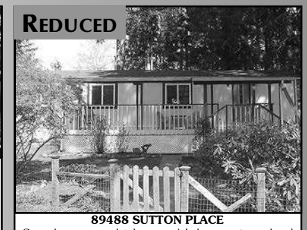
Cozy home completely remodeled great weekend spot, vacation home or live there full time. Large corner lot, garden area, shop, garden shed, storage shed and extra parking. Large deck offers great area to sit and enjoy the natural surroundings. $159,500 #11615 MLS#18665750

seclusion, and solitude. Quaint, charming & ready for you! A forest awaits you just out your living room. New December 2016: vinyl plank flooring, bedroom carpet-ing; new as of spring 2017: vinyl windows & ductless heat pump with A/C. Tiled kitchen. Wood burning brick fireplace and single garage. Raised garden beds, garden shed & new fencing in front yard. View 4th of July fireworks from living room. Priced to sell & won't last long. $207,500 #11623 MLS#18000014