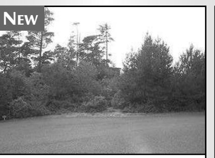
WINDLEAF WAY #85

Close to Bay Street and Downtown Florence. This ranch style home is 1409 sq. ft. 3 bed, 2 bath, with a 2 car garage. This home has a covered deck, fenced backyard, newer paint in and out, storage cabinets in garage