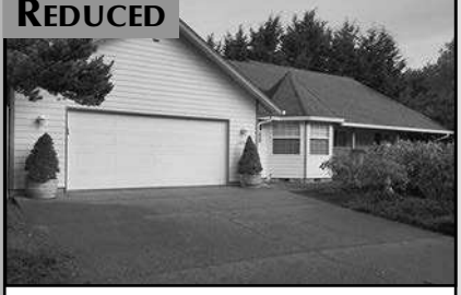
4881 CLOUDCROFT LANF

Nice affordable little home close to shopping and other services. Small outbuilding, large fenced yard and RV parking. $94,900 #11603 MLS#18425951