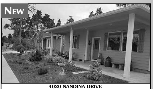
Move-in ready, "Siletz Model" in the new gated community of Sandpines East, bordering Florence Golf Links. Morning sun floods the eat-in kitchen w/quartz countertops in this beautiful & gently lived in home. BBQ or the wind protected covered patio in a fenced backyard. Custom romar shades through out, lovely room divider w/art niches. Roll-in shower. Enjoy sunsets & upgraded landscaping complete w/birch trees from covered front porch. $304,500 #11670 MLS#18493786