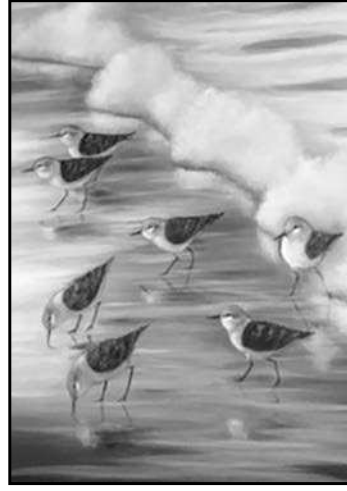
See these works and more by local artists during the 2nd Saturday Gallery Tour.