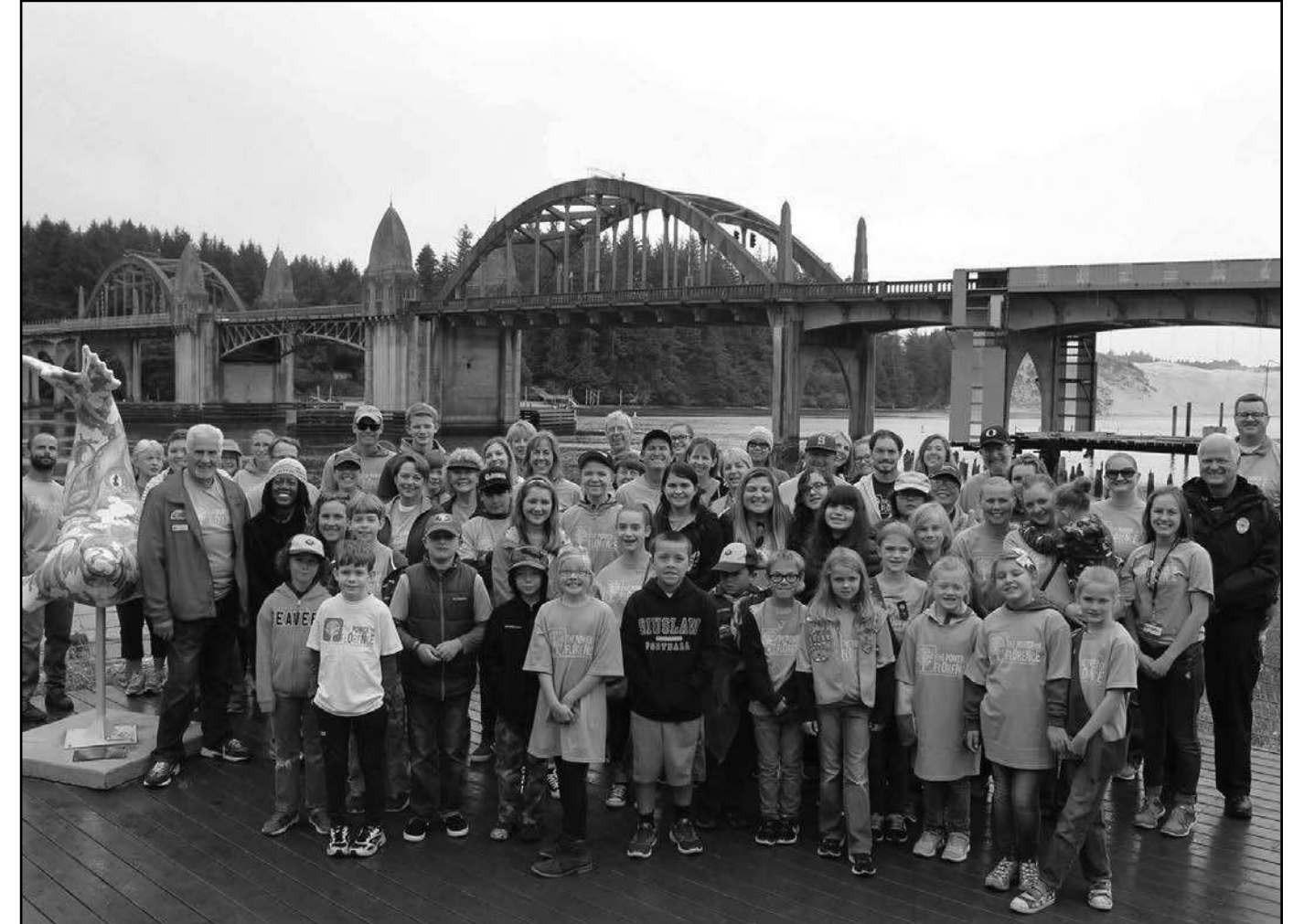
Citizens of all ages are encouraged to participate in the eighth-annual Power of Florence event set for July 21.

ence, a city-wide day of volunteering and helping others, is scheduled for Saturday, July 21. The Florence City Council officially proclaimed the third Saturday each July as health screenings. a day dedicated to joining together to make a difference by fundraising, volunteering and attending community volunteers join together to beautify service projects.