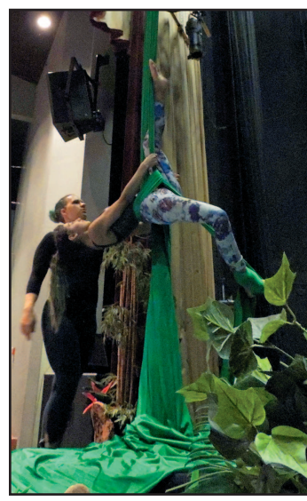
Revelers Aerial Works teaches students how to ascend silks in a special workshop Thursday.

Tickets are $18 for adults and $12 for youth 10 and under. Purchase tickets at the Box Office, by calling 541-997-1994 or visiting eventcenter.org.