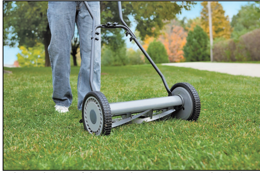
Gardening enthusiasts can find a way to make spring even more green by embracing several eco-friendly gardening practices as they bring their lawns and gardens back to life in the months to come.

According to the Planet Natural Research Center, an online resource for