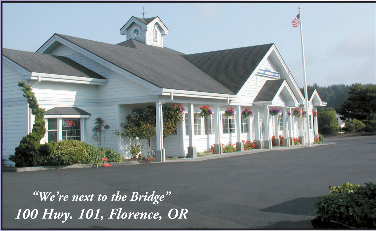
"We're next to the Bridge" 100 Hwy. 101, Florence, OR