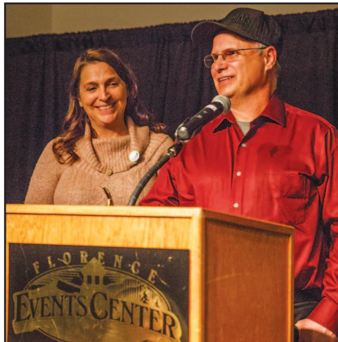
Tony's Garage — "Stu Johnston" Business of the Year Award