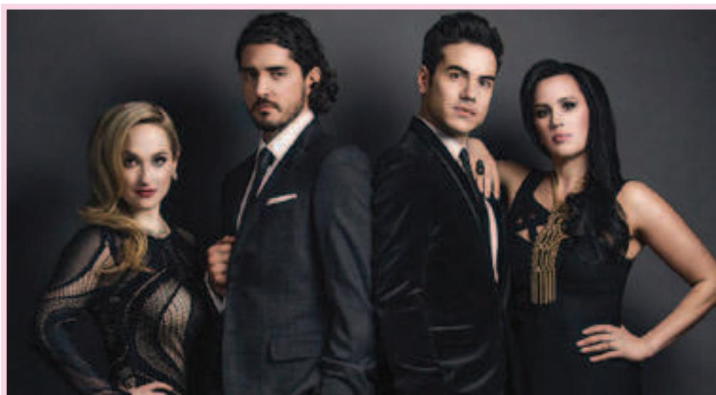
Vivace - May 24

Seacoast Entertainment's 2017 – 18 Coastal Concert Series presents Orchestra at the Ocean in March.