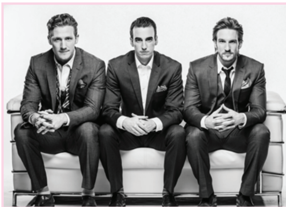
Gentri: The Gentlemen Trio - April 19