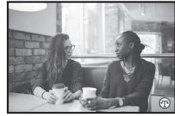
Help your loved ones heal by giving them time to talk and share memories.

on the grieving person to figure out what to bring and when.