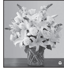
1-800-Flowers.com developed a sympathy advice and etiquette online resource guide.

To further help, 1-800-Flowers.com has created an online sympathy hub for tips and advice, directly from experts, on how best to express sympathy and condolences. Topics include Appropriate Sympathy Etiquette Across Different Religions, How to Write a Eulogy, How to Create a Memory Garden and How to Cope With Grief Around the Holidays.