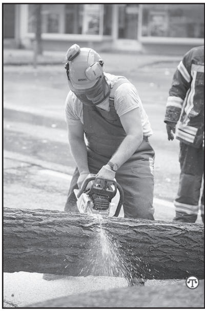
In times of trouble, Americans help each other, often thanks in part to quality outdoor power equipment.

After one of the most active hurricane seasons on record, the steady hum of generators is also part of the post-disaster landscape. When the grid is knocked out by strong storms, generators stay on, powering the heating and cooling infrastructure, as well as communication systems, that communities need. Smaller units power air-conditioning or heating systems, appliances, lights, phones and even laptops. Larger backup generators keep emergency response operations and hospitals up and running. And as