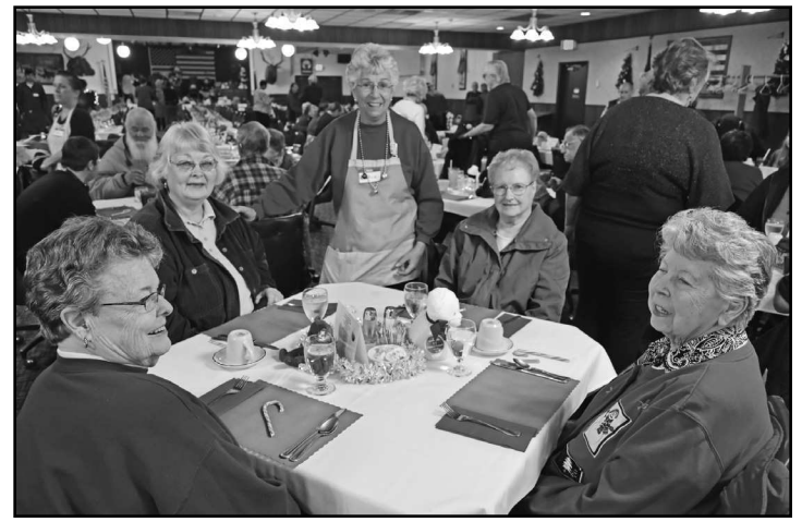
Hundreds of people enjoyed the freshly-prepared Christmas Day dinner at Florence Elks Lodge.

For more information about the Elks Lodge, call 541-997-2610.