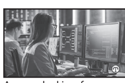
Anyone looking for a new or alternate career should be glad to learn cybersecurity is a field with many job openings for those with the skills and knowledge to fill them.