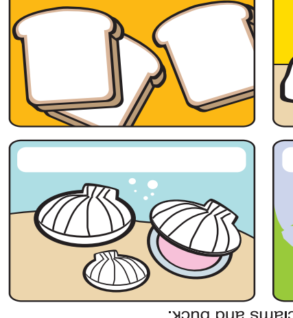
ANSWERS: Bread, dough, clams and buck.

Each picture below represents a slang word for money. Can you guess what each one is?