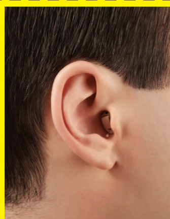
Audiotone Pro CIC

Save on one of our smallest custom digital hearing aids!