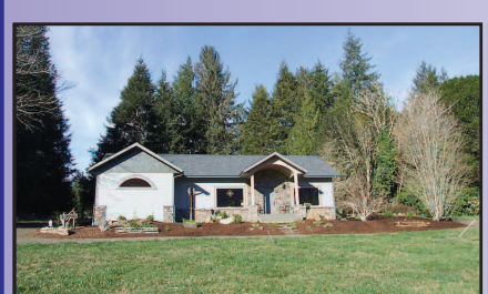
TOP QUALITY - CUSTOM DESIGN 2013 Carter Bros. built home with sweeping view of the North Fork of the Siuslaw River. Pasture and wooded views from every window! Ductless heat pump provides cool air (you'll need it here in this banana belt!). Propane

fireplace cozies up your rainy days! RV hook-up, guest studio and large workshop/storage building. Mature landscaping, cedar grove, must see! $499,999 #11190