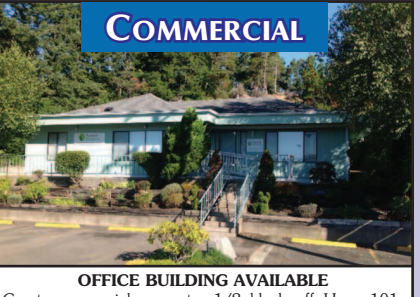
Great commercial property: 1/2 block off Hwy. 101 ample street and lot parking; 1660 sq. ft. on .30 acre lot Wheelchair ramp entrance; Reception-entry area; genera and private office areas; lab area; two 1/4 baths; six multi purpose meeting rooms. Great condition; Great opportu nity, Locate your business here! Great Price! $255,000 #11366 MLS#16333396