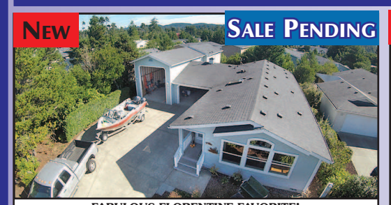
FABULOUS FLORENTINE FAVORITE! Great interior with wood flooring. Spacious dining area opens to larg living space with several southern exposure windows. 3BD/2BA with large master & en suite bath open to back courtyard with covered patio & large hot tub. Fabulous garage space with full hook-up, 32' RV bay! Storage space will be a favorite area for vehicles & recreational toys! Heated 18' shop in back of garage with 50 amp power. $280,000