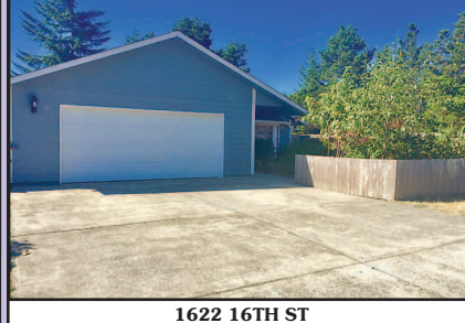
Newer in town home next to bike path & Miller Park. This 1794 sq. ft. 3 bed, 2 bath home has laminate and tile throughout. Quiet dead-end street with fenced back yard 2 car garage has additional attic space. Nice home w/all MLS#17587599

Desirable 55+ Florentine Estates home has a bright oper floor plan. This 3 bed, 2 bath 1782, sq ft home has vaulted ceilings, ceiling fans, ample storage and a split master floor plan . The kitchen has upgraded appliances, wood floors, skylight, and counters trimmed in tasteful tile work. The car finished garage has extra shop and attic space and vinyl siding. $249,900 #11525 MLS#17474256