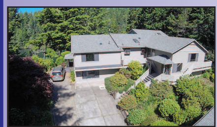
WOAHINK LAKEFRONT WITH BOAT HOUSE Over 3200 sqft, 3 bed, 3.5 bath lakefront home. Perfectly aintained, lush, rhododendron filled grounds, large de tached garage with guest/caretakers quarters above. Covered boat/RV parking. Beautiful home nestled on .72 acre parcel overlooking Honeyman Park. On the lake's edge rests an exceptional boat house, dock & deck. This is the complete package offering dramatic yet serene lakefron living. $644,000 #11468 MLS#17066573