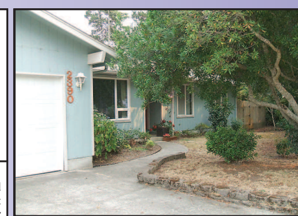
2390 SPRUCE STREET Large corner lot w/ fenced yard. Room to park an RV or boat. Double car attached garage w/ lots of storage shelving. Home is one level w/ large family room, living room and eating bar in kitchen & large formal dining room. $240,000 #11533 MLS#17172220