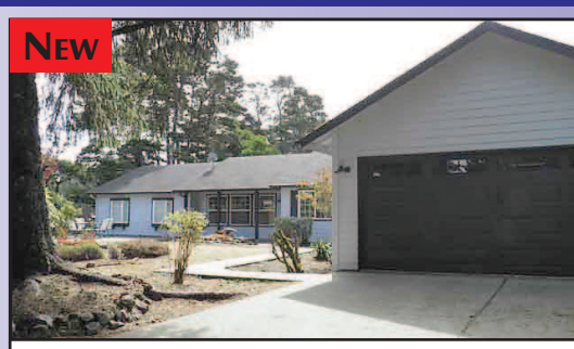
4760 S HARBOR VISTA DRIVE Fully remodeled beach area home on large fenced corner lot. Fresh and like new inside and out including, floors, paint, appliances, fixtures and more! Vaulted ceilings, sunroom and huge den that could be a third bedroom suite. Pack your bags; this place is move in ready! $325,000 #11541 MLS#17237733