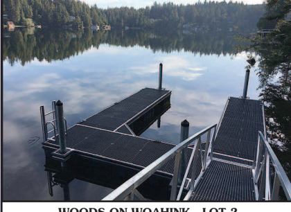
WOODS ON WOAHINK - LOT 2 One of Woahink Lake's finest locations. New custom homes all around, end of road privacy & seclusion Wonderful lake views, easy walk to lake shore & shared dock. Build your dream home today. $249,000 #11182 MLS#16299382

fireplace cozies up your rainy days! RV hook-up, guest studio and large workshop/storage building. Mature landscaping, cedar grove, must see! $499,999 #11190