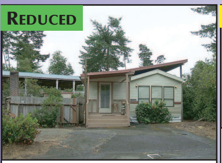
209 RHODY LOOP This is a unique property w/ a spacious add-on of 2 large rooms and a utility room. There is a private fenced patio and a storage shed as well as upgraded electrical & a paved driveway. $25.00 Transfer fee to be paid by buyer @ COE $79,000 #11523 MLS#17069932