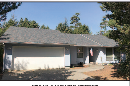
87842 SALTAIRE STREET Great location on the Central Oregon Coast - Close to the North Jetty & Harbor Vista Park. Private setting on a nice corner .30 acre lot. Covered entry 3 bedrooms and 2 baths. Just over 1300 square feet. Living/dining area. Cozy galley kitchen with eat-in area. Attached 2 car garage. Newer roof. $249,000 #11439 MLS#17125712