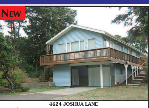
A rare find at the beach. This home is o nfortably furnished, move i ready. Back deck is fenced for privacy w/ small storage shed. Lower leve has a single car garage and storage room. Get away from it all at the coast. 3 blocks from the beach! $269,000 #11543 MLS#17202906