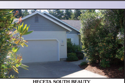
HECETA SOUTH BEAUTY Custom built beauty. Enjoy the privacy on this .31 acre property located in the sought after Heceta South area. Relax in the 1794 sq ft of light and bright living space. The breakfast nool overlooks the large deck and nature filled backyard. Spaciou kitchen with Corian counters, top of the line appliances and breakfast bar. Tile entry, high ceilings and master suite with jet ted tub. Gated RV parking w hookups. Storage shed, art studio, workshop. Raised garden beds. Pride of ownership shows ir every detail. This one will not disappoint. $358,000 #11497