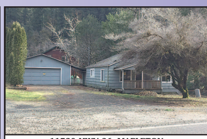
11720 HWY 36, MAPLETON RIVERFRONT OPPORTUNITY...Owner financing available. 1/2 acre setting with OLD cabin in need of major overhaul. Basement allows for easy access under the home. 816 square foot detached garage, water, electric & septic. Fenced yard with rushing creek alongside. 64' of river frontage. Major fixer or start over. Great project for 2017! $139,000 #11412 MLS#17038344