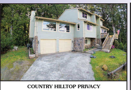
the wind & fog. Huge living room and modernized country kitchen. Heat Pump. 3 decks for outdoor living and entertaining. Enjoy the peace & quiet of the North Lakes area, just 10 minutes from town in this 3,000+ square foot, 4+ bedroom country home. $398,000 #11458