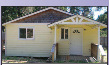
4669 PACIFIC AVE NOT A FIXER, BUT A FINISHER. Com started with permits but needs finishing and TLC. Tucked away from the street within easy walking distance to the boat launch at Siltcoos Lake in Westlake. Hardi Plank siding, 3 year old roof, laminate flooring and new carpet. Going to the Dunes? Just minutes to the Oregon Dunes National Recreation Area. Over 1/3 acre of yard fenced