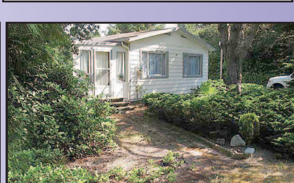
LOCATION, LOCATION Waiting for a new home. 1974 manufactured has seen better days but has enjoyed being placed on a level lot in the Beach area that is just under a half acre. Paved driveway, RV parking & hook-ups, 2-car detached garage, carport with storage, and more. Power and Heceta water rar still connected. What you see and including septic system is "AS IS" Buyer to do own due diligence. $130,000 #11420 MLS#17633238