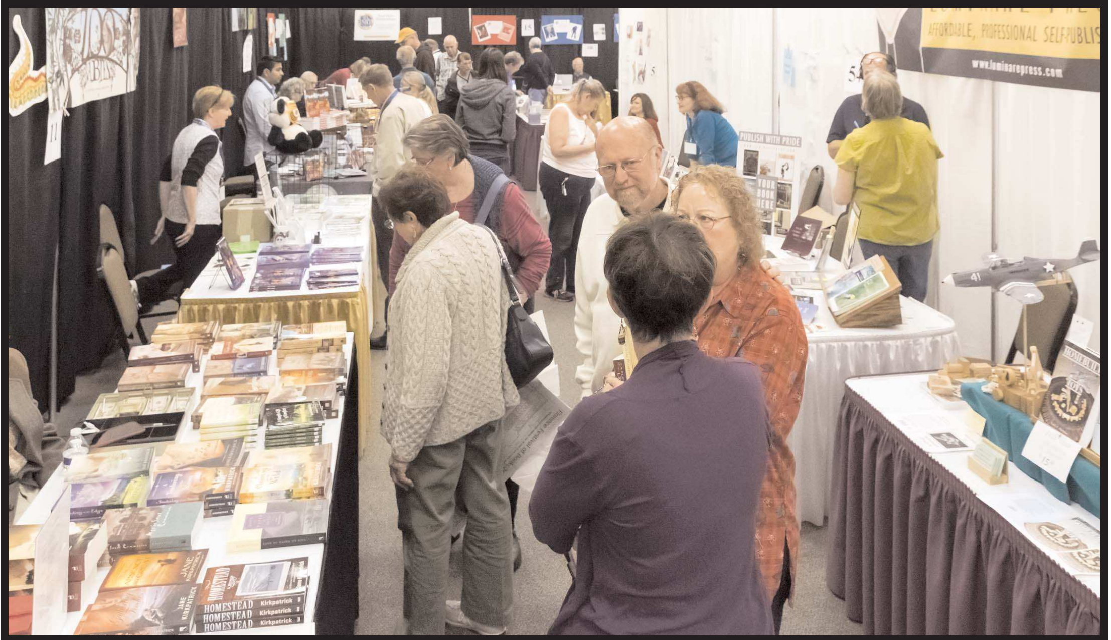
Visitors to the annual Florence Festival of Books can expect dozens of authors and publishers, as well as writing workshops each day during the festival.