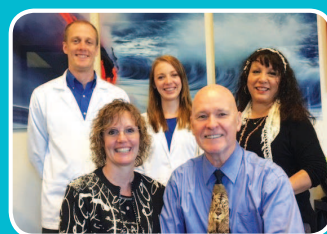
Best For Hearing Staff

Call today for your FREE Hearing Consultation