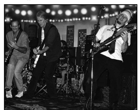
Mr. Wizard

Three Rivers Casino Resort, 5647 Highway 126, will present the band Mr. Wizard at Blue Bills Sports Bar and Tap Room on Friday, July 21, and Saturday, July 22, from 9 p.m. to 12:30 a.m. The group shifts from rock to top 40, country, reggae, funk and blues.