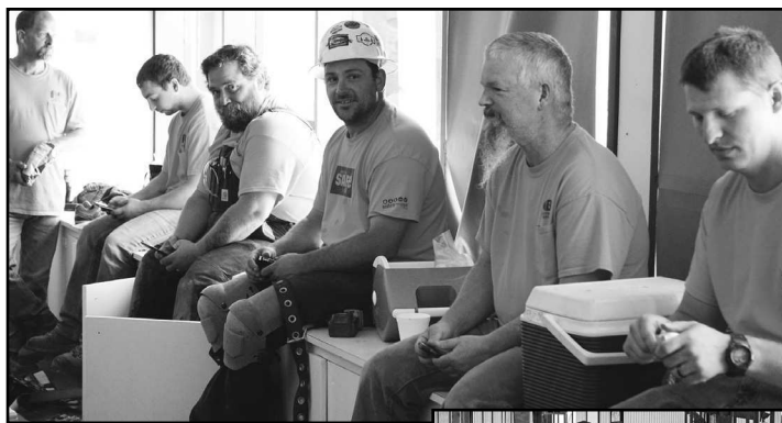
More than 40 people are working all summer to complete Mapleton's upgrades.

"These kids deserve every opportunity they can get, just like every other kid in every other community. It shouldn't matter that