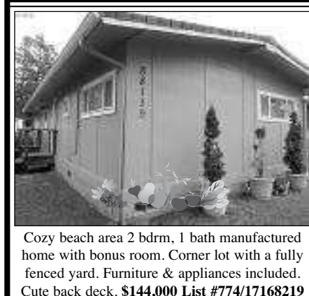
Cozy beach area 2 bdrm, 1 bath manufactured home with bonus room. Corner lot with a fully fenced yard. Furniture & appliances included. Cute back deck. $144,000 List #774/17168219