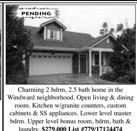
Charming 2 bdrm, 2.5 bath home in the Windward neighborhood. Open living & dining room. Kitchen w/granite counters, custom cabinets & SS appliances. Lower level master bdrm. Upper level bonus room, bdrm, bath & laundry. $279,000 List #779/17124474