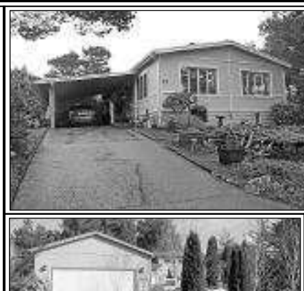
Florentine Estates 3-bdrm, 2.5 bath, triple wide home with 2550+ sq. ft. of living space. Attached 2-car garage. Private setting is lushly landscaped. Vaulted ceilings, additional rooms & sun porch. $287,500 List #684/15282955