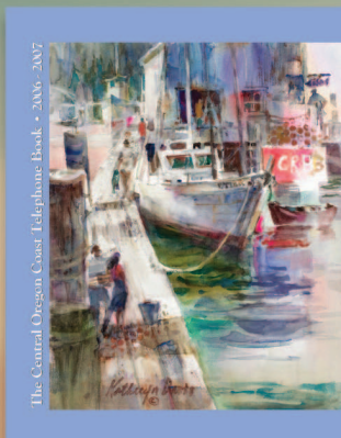
Previous Artist Covers