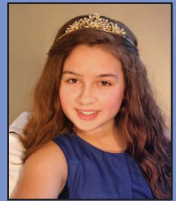
5th-grade: Ava Center