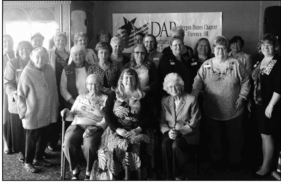
Members of the Dunes Chapter of the Daughters of the American Revolution gathered recently to celebrate the groups ninth anniversary

Since its inception the Oregon Dunes Chapter has been active in our community. Members catalogued the bricks at the Veteran's Memorial Park to create a directory, and pre-