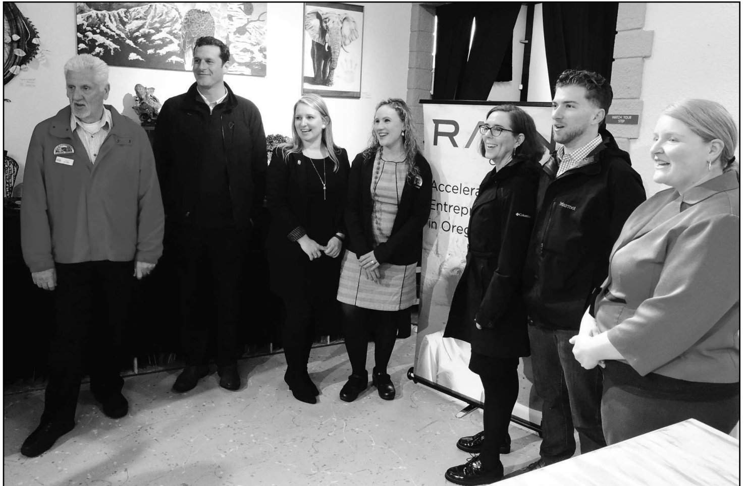
Gov. Kate Brown (third from right) visits a local art studio and hears about RAIN's partnership with coastal entrepreneurs and The City of Florence.

Visit the Siuslaw News online at WWW.THESIUSLAWNEWS.COM