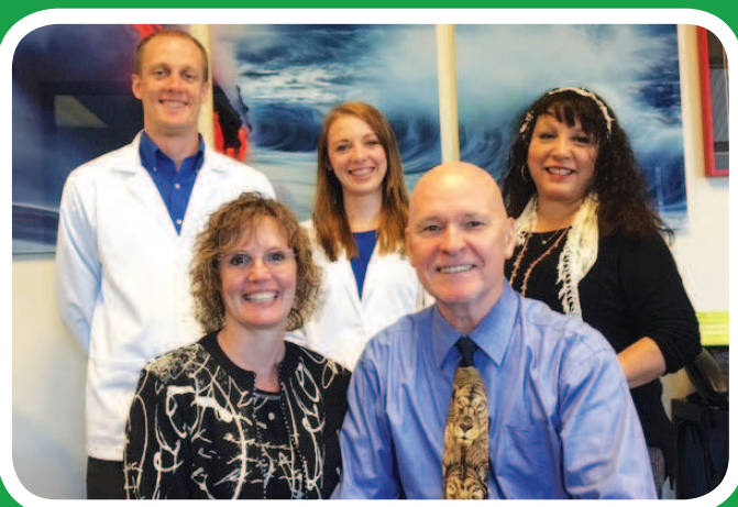
Best For Hearing Staff

Coupon must be present at time of purchase. Valid on a pair of premium level hearing aids.