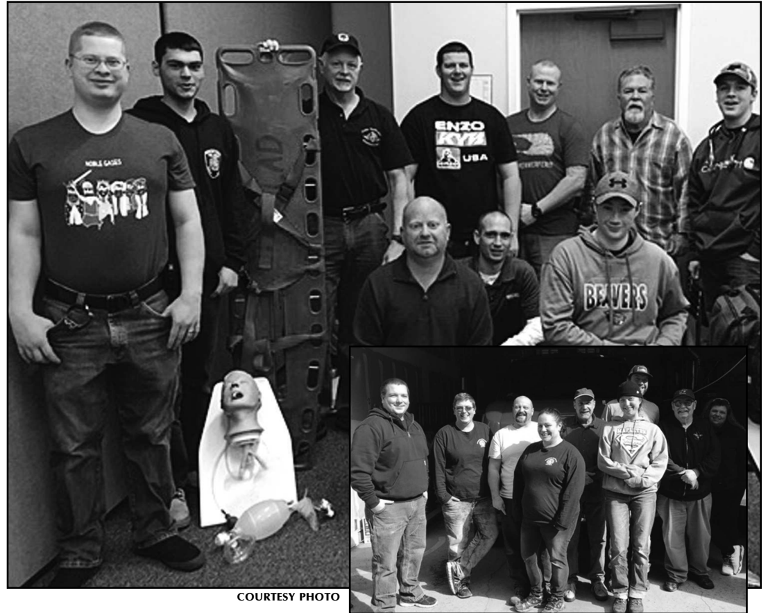
Volunteer firefighters from Florence (above), Mapleton, Swisshome and Deadwood