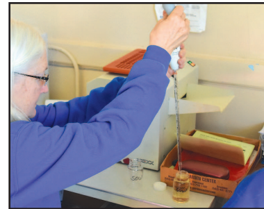
Members of the Blue Water Task Force take freshly drawn water samples to the offices of the Siuslaw Watershed Council in Mapleton for preparation and testing each month.

For more information on the Siuslaw Volunteer Water Quality Monitoring Program contact the Siuslaw Watershed Council at 541-268-3044 or email Siuslaw.org.