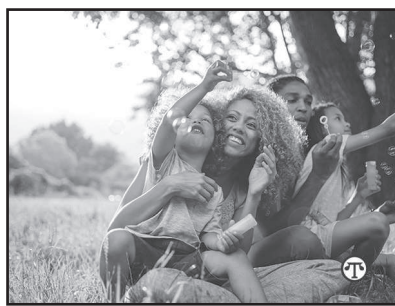
Five simple steps can help your vacation dollar go farther.

4. Food and meals can offer a big opportunity to save money. During the plan-