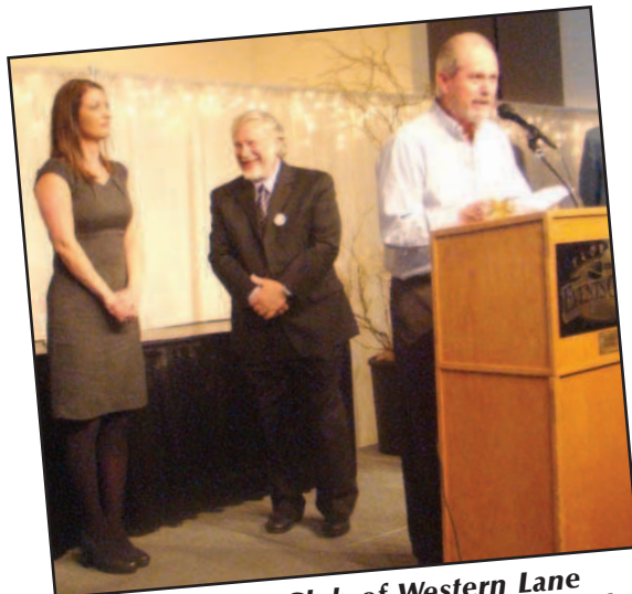
Boys and Girls Club of Western Lane County — Nonprofit Achievement Award