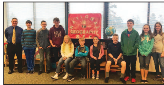
Top 10 Siuslaw Middle School Students