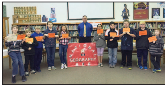
Top 11 Siuslaw Elementary School Students