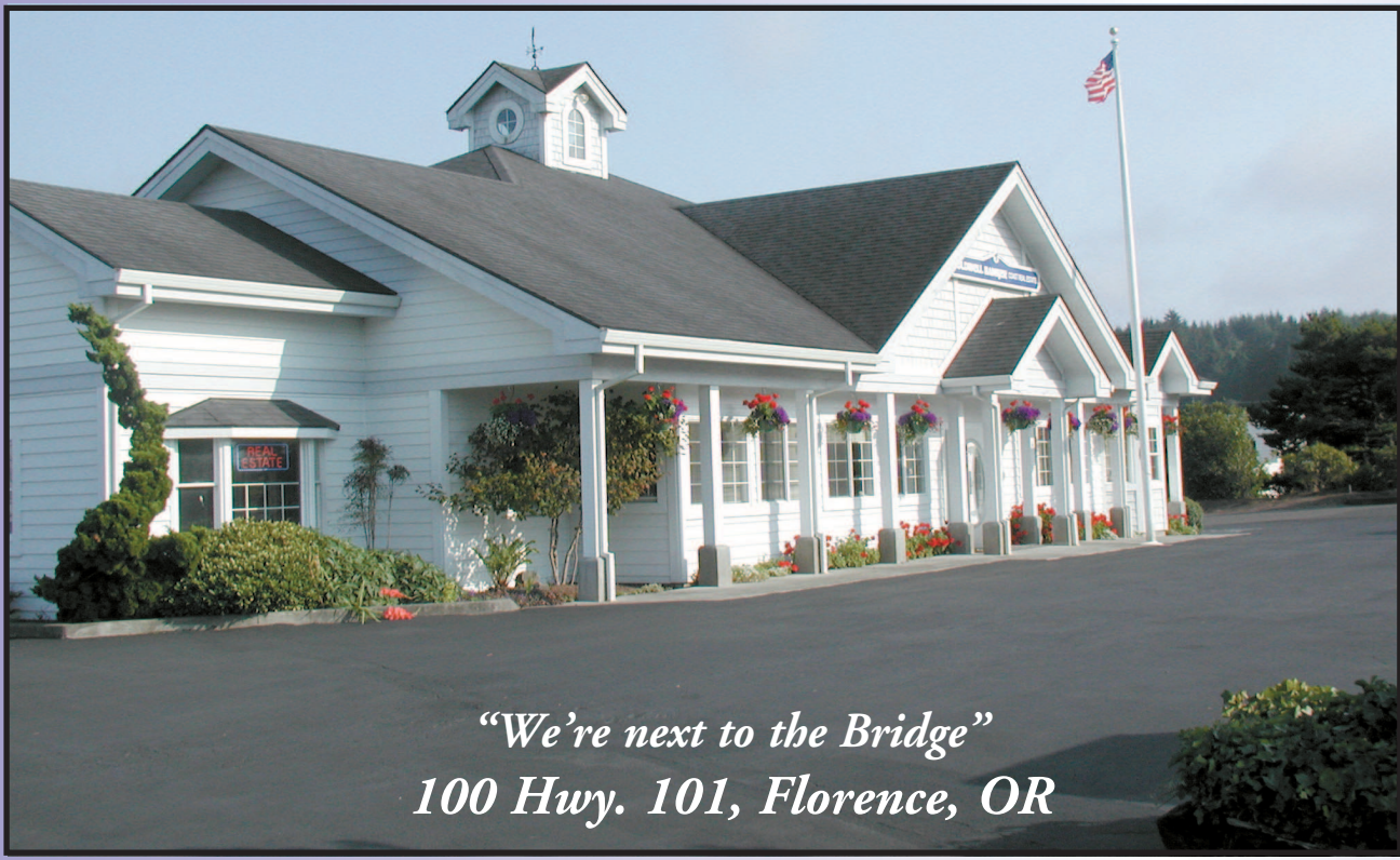
"We're next to the Bridge" 100 Hwy. 101, Florence, OR