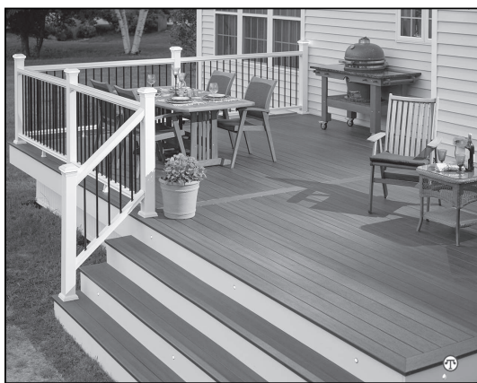
Composite decking can give you natural wood beauty without all the work.

What about sustainability? Is composite decking really environmentally friendly? In a word, yes. No trees are ever felled to produce Fiberon decking. Instead, the company uses mainly recycled plastics and lumber mill scraps-enough to prevent 60,000 tons of waste from reaching landfills and incinerators each year. Sustainable manufacturing processes capture 98.5 percent of waste materials. A closed-loop water system prevents water discharge. What's more, composite decking lasts far longer than typical pressure-treated lumber. That