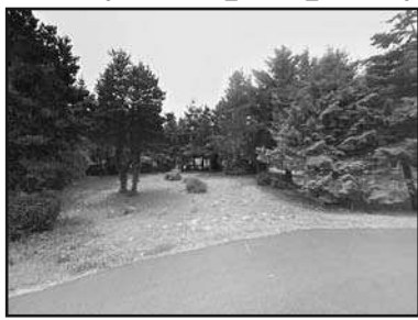
Parkside Dr #1200 — Not too many beach area lots left. This one is cleared with a few trees remaining. Level, 0.18 ac lot with underground power, water available, and a blanket septic approval for a sand filter system. And this lot has no CCRs. $42,000. #2299-14639483