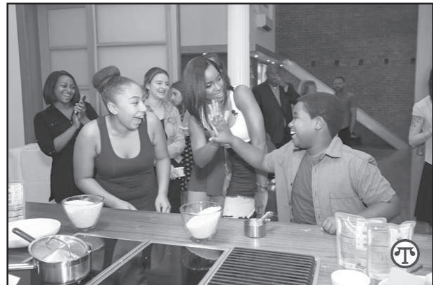
Singer Kelly Rowland and her family like cooking and eating together.