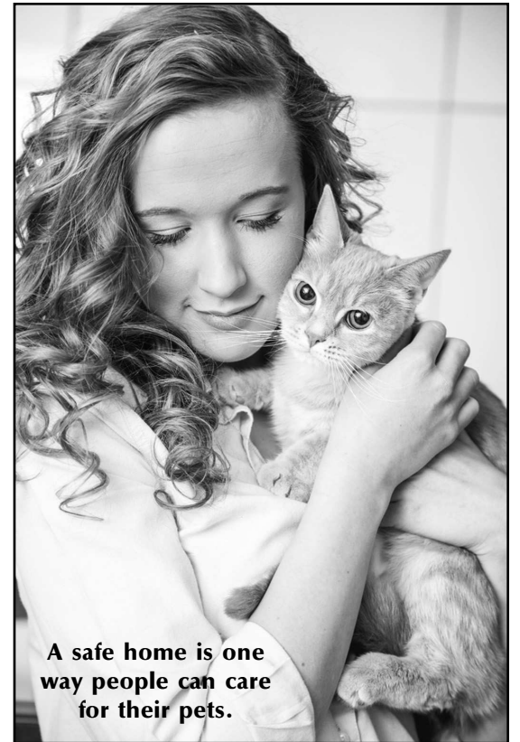
A safe home is one way people can care for their pets.

• Provide a comfortable indoor climate. Many pets spend the majority of their days indoors where climate and temperature can be controlled. However, if yours is an outside pet or requires a brief stint in the garage or an uninsulated area, make sure the tempera-