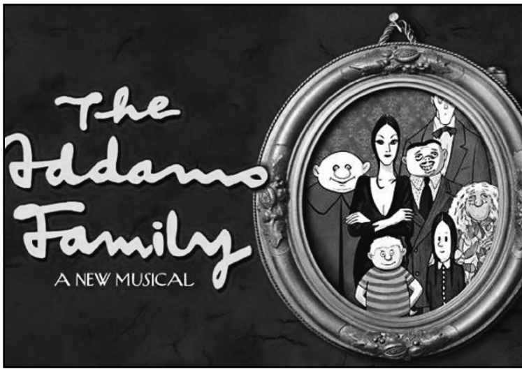
CROW will hold auditions for its spring production of "The Addams Family" musical in January.

Local audiences may recall that last spring, CROW pro-