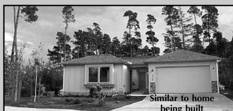
Similar to home being built

A gated 54 lot subdivision of new homes next to the 9th hole at Sandpines Golf Course.