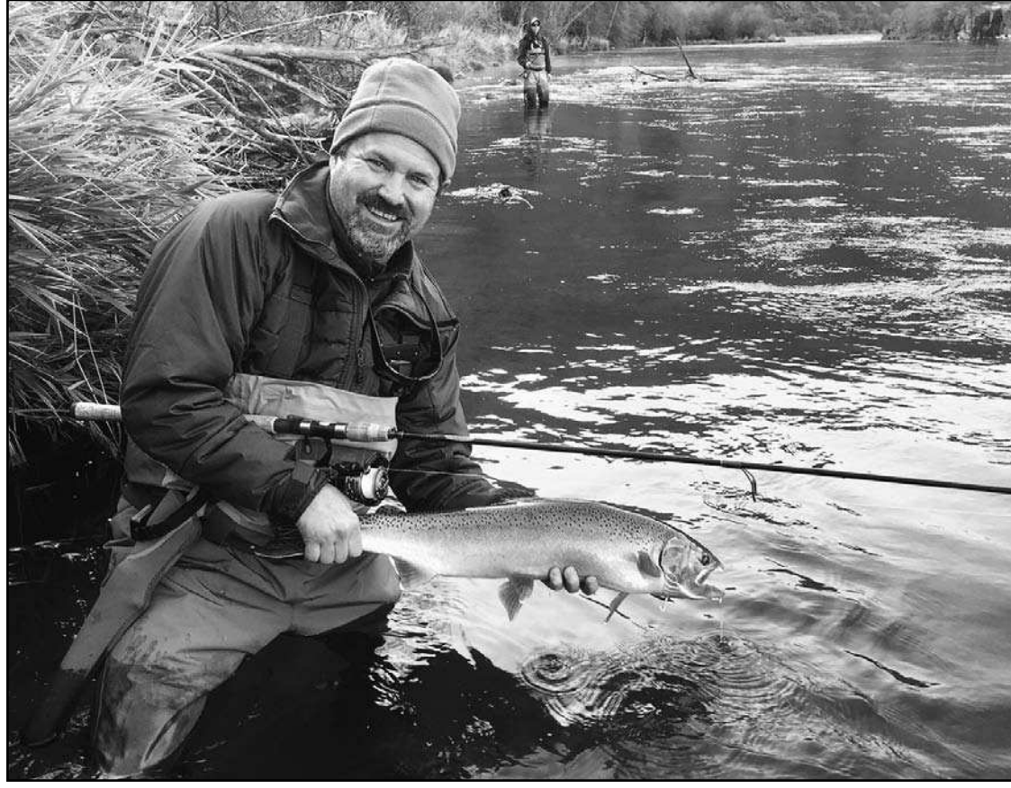
Catching steelhead in the Lower Deschutes River.

Visit the ODFW website www.dfw.state.or.us/resources