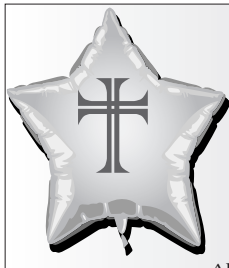
Wednesday's Graphic All Souls Day November 2, 2016