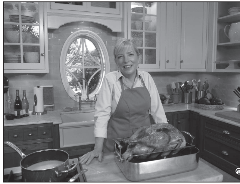
To look sharp when carving a turkey, make sure the knife you use is sharp, advises cookbook author and chef Sara Moulton.

a sharp knife. Fortunately, the Chef'sChoice highly acclaimed XV EdgeSelect applies a flawless, ultrasharp, triple-bevel Trizor XV edge while precision guides eliminate guesswork. In fact, Cook's Illustrated, published by America's Test Kitchen, "Highly Recommended" the Chef'sChoice Trizor XV Model 15 electric knife sharpener, and noted that, "with diamond abrasives and a spring-loaded chamber that precisely and gently guided the blade, it purred with perfection, consistently producing edges that were sharper than on brand-new knives with edge to tip." The magazine also noted this "big perk: it can convert a 20-degree edge to a sharper 15 degrees."